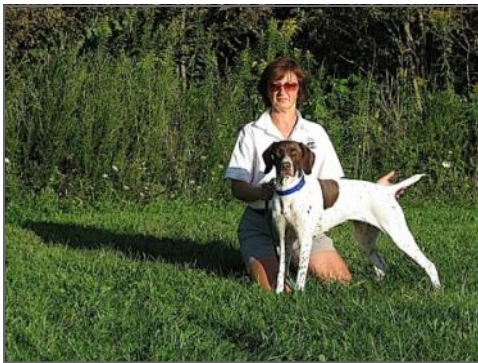
VC DuCorbeau Willow FD