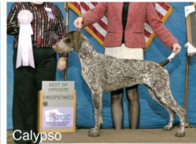
Calypso De Lombardie V Bulkley Sagamite